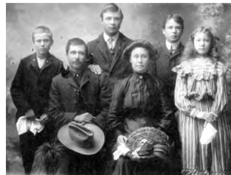
Francis Marion Family