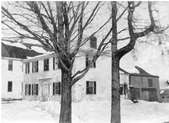
Niran Bates House with school house on right